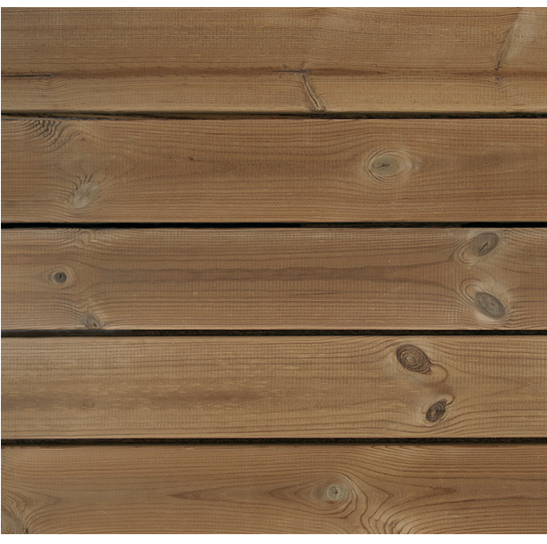
Please follow Thermoarena's installation instructions when working with thermal wood

Thermal modification is a 100% natural method for increasing the durability and dimensional stability of wood, likewise for reducing water absorption. During the process, the wood is heated to a temperature of 180-220°C, while lowering the moisture content of the wood up to 4-6 %. Thermoarena conducts careful quality control of the wood before and after thermal modification. The lumber used for TM is checked and certified.